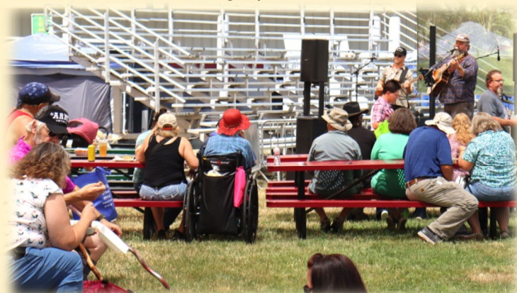
Below: The June Bugs perform.