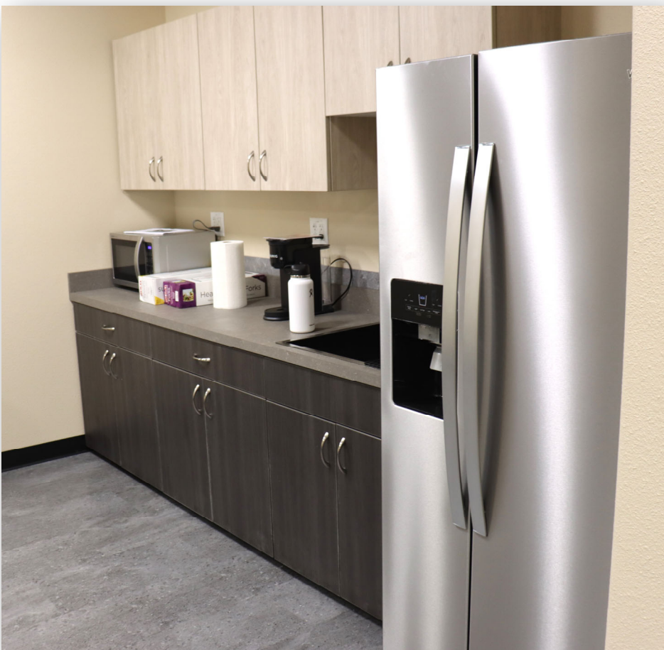
New break room area.