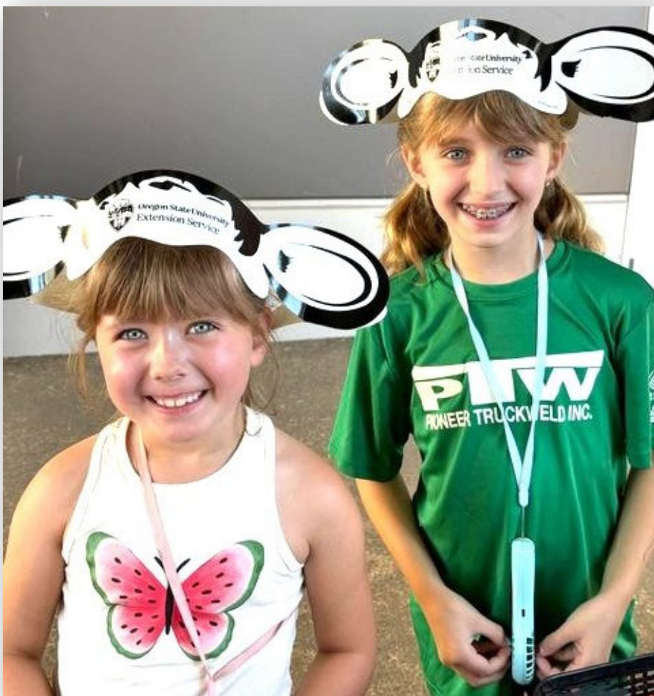
Free cow ears from OSU Extension-Linn County were very popular.