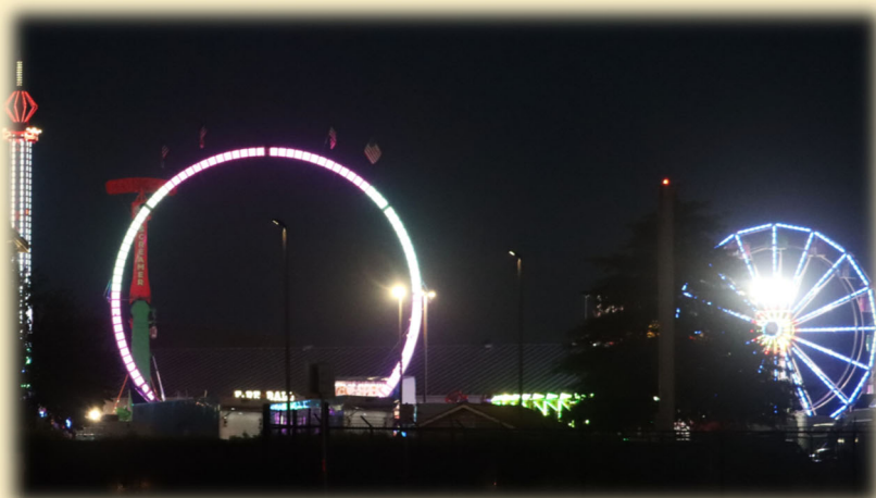
Good night from the Linn County Fair.