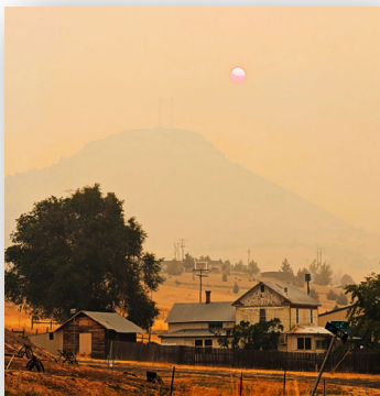
Hazy sunrise at Fossil, Oregon - July 2024 - Lone Rock wildfire