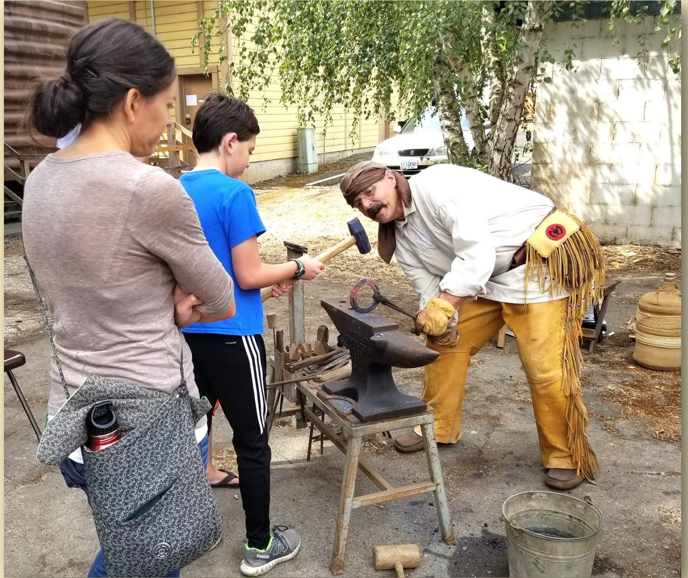
A few of the many hands-on programs that will be featured at the upcoming Hands on History day August 24 in Brownsville.

Contact us at 541-466-3390 or lchm@co.linn.or.us