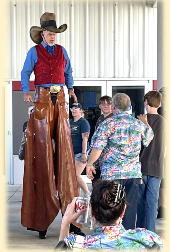
Always interesting folks walking around the fair.