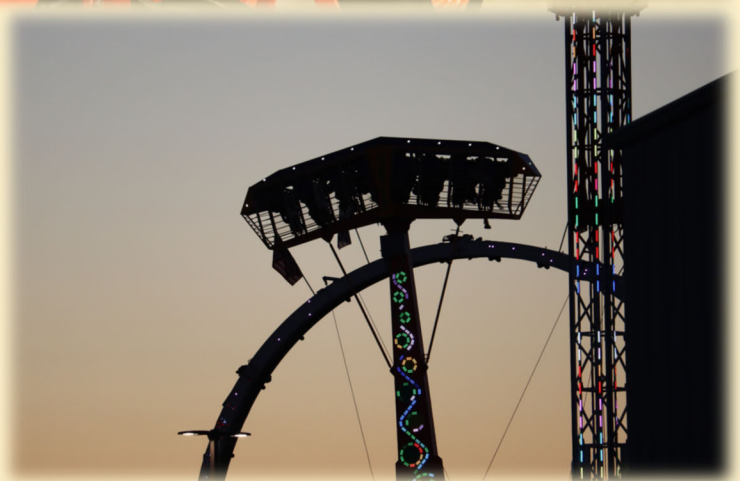
Above: Folks enjoyed just hangin' around at the fair.