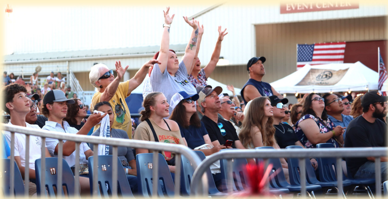
Fans hope to catch t-shirts before one of the Main Stage concerts.