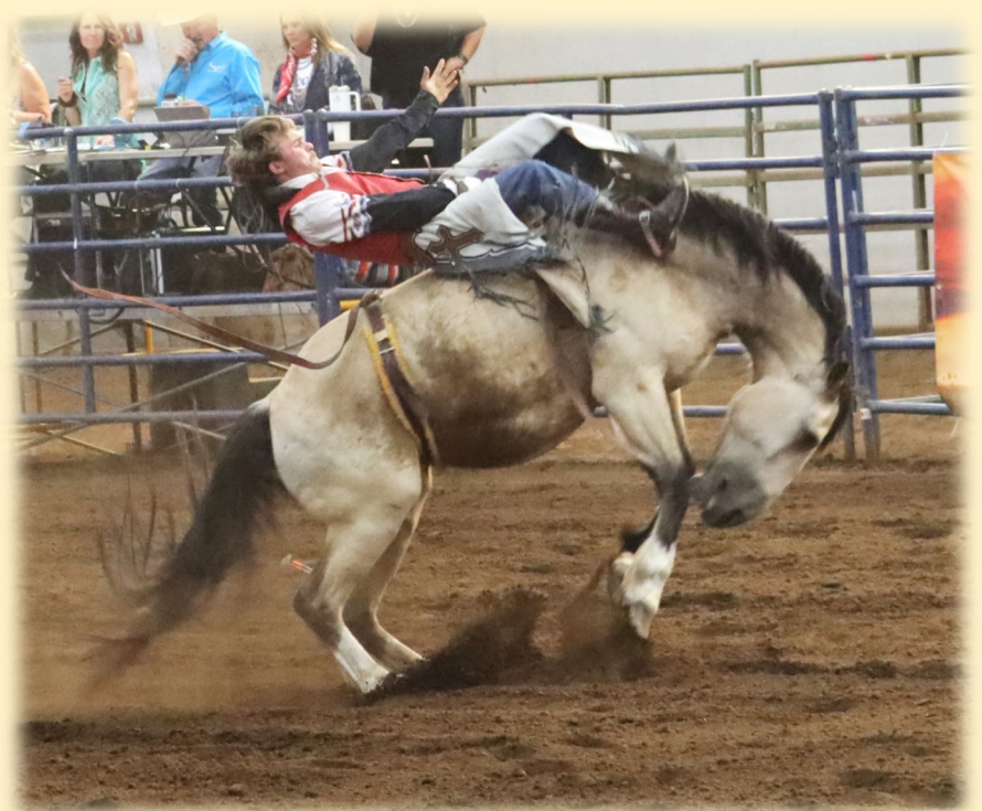
Hell on Hooves rodeo is always fun and exciting.