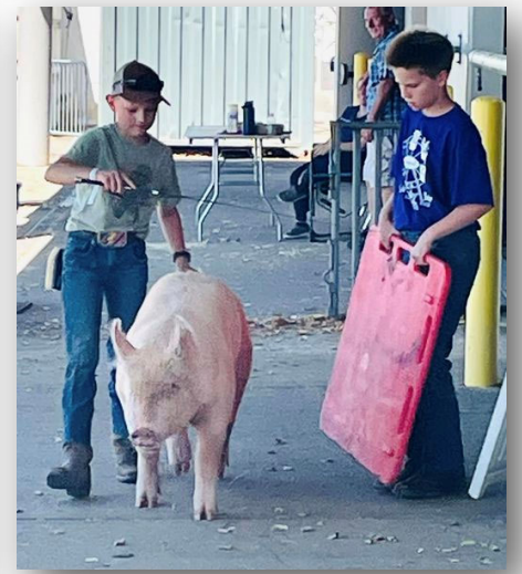
Left: The Sweet Home FFA chapter received a $100,000 donation from Ag West to purchase a new vehicle.