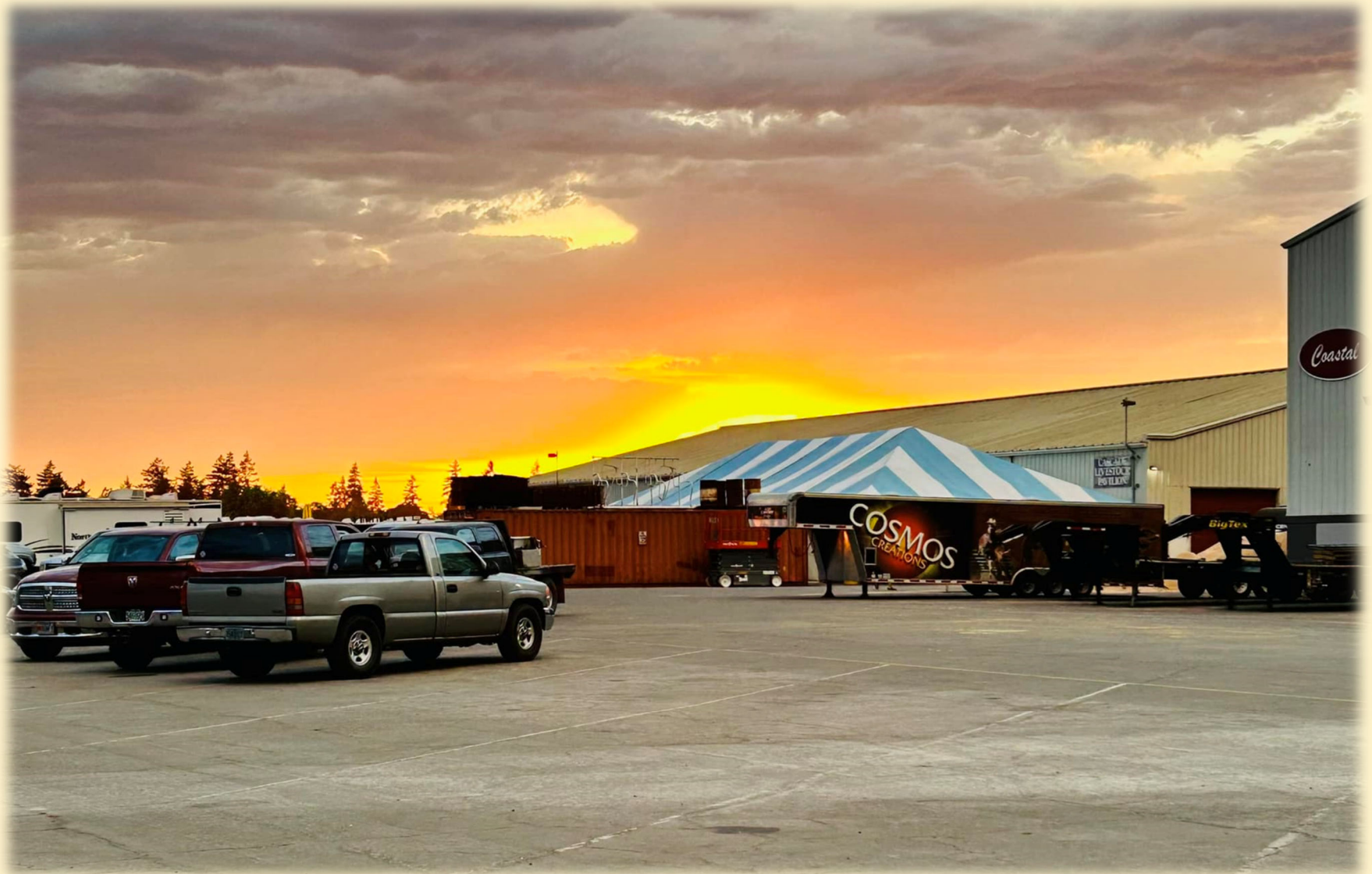
10-year-old Sophia Sullens of Sweet Home captured this colorful photo of a sunset over the Linn County Fair. It had almost 24,000 views on Facebook.