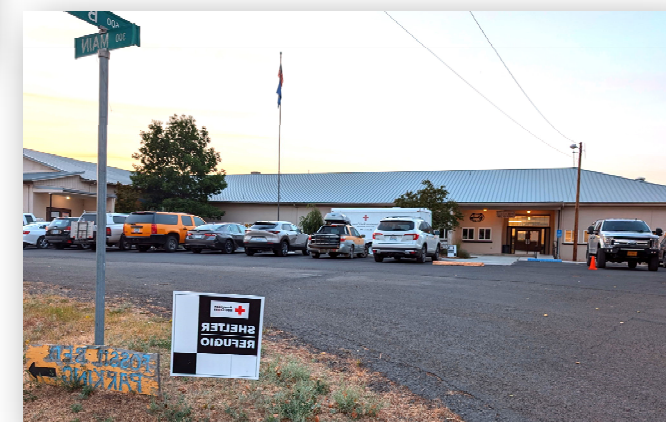
Wheeler High School - Fossil, Oregon