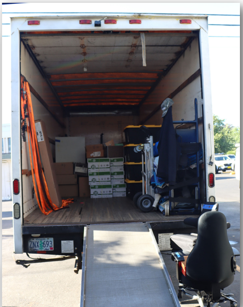
All packed up and moving out on Wednesday, July 24.