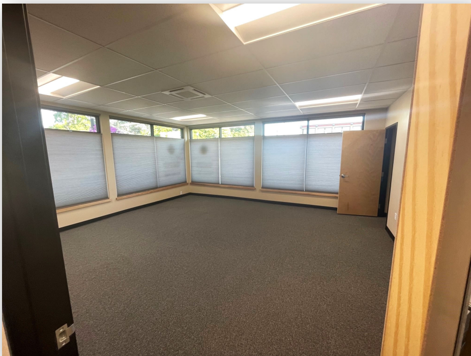
The new Veterans Services office features a large conference room that can be used by all county offices and departments.